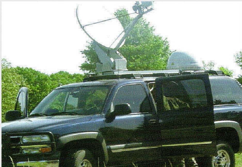
One of the Communications Vehicles of the 47th Civil Support Team of the Mississippi National Guard. Members of the Unit will present the program at the August Club Meeting.

licensed as a TECH with code privileges. Please make sure you bring a COPY of your license and any documentation. We will not have access to a copy machine at Ryan's.